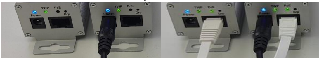
Both devices connected with each other.